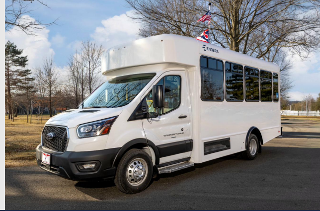
ADA Lift Available (Front and Rear)

*Dependent on vehicle configuration, floor plan, and option content