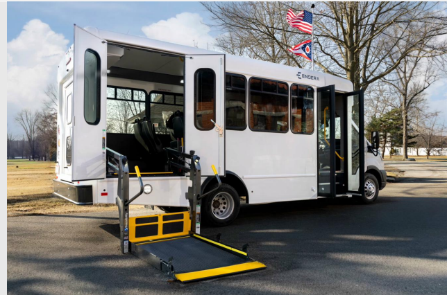
Galvanized Steel Cage Structure