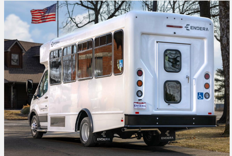
REAR 3/4 VIEW — ADA ACCESSIBLE