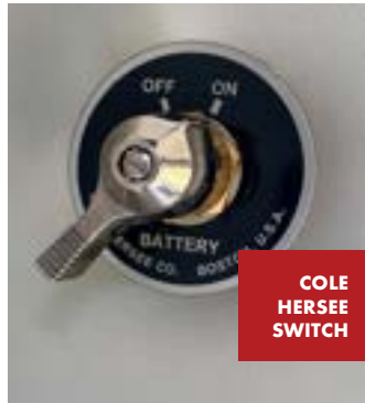
COLE HERSEE SWITCH